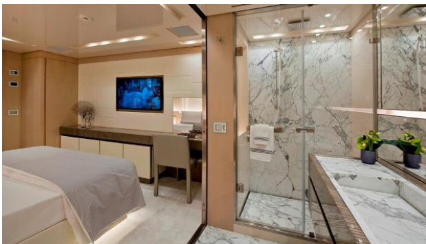
VIP STATEROOM 1