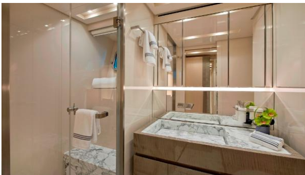
GUEST HEAD 1