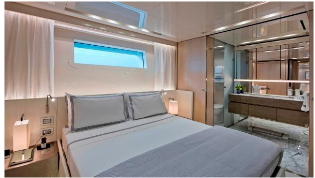
VIP STATEROOM 2