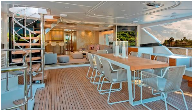
UPPER DECK DINING