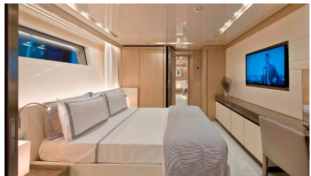
VIP STATEROOM 1