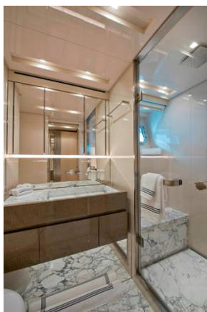
GUEST HEAD 2