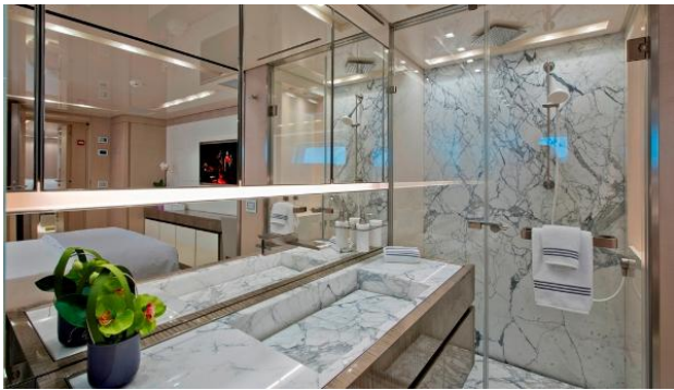
VIP HEAD 2