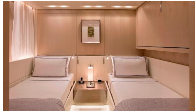
GUEST STATEROOM 1