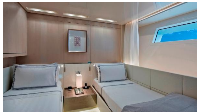
GUEST STATEROOM 2