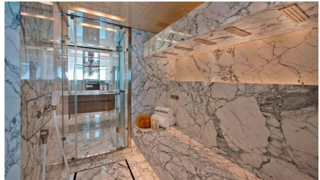
MASTER DORNBRACHT SPA SHOWER SYSTEM