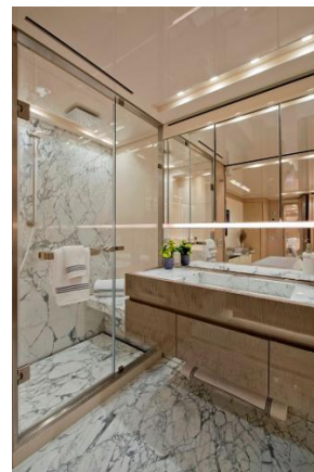
VIP HEAD 1