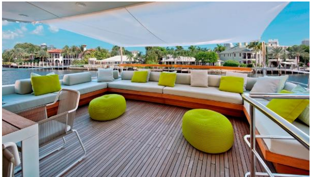
UPPER DECK COCKPIT