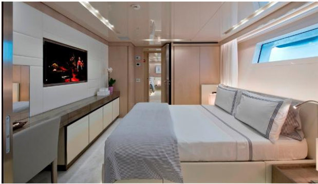
VIP STATEROOM 2